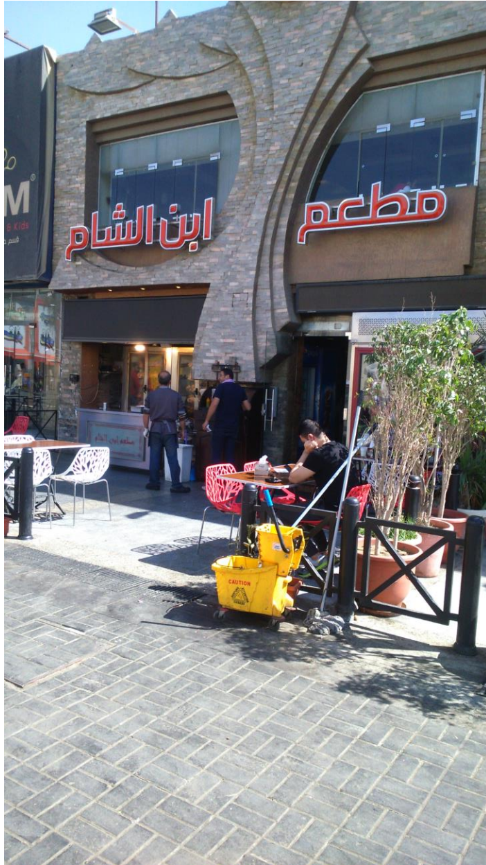
Fig (6) Ibn ElSham Syrian restaunt (opening just beside Egyptian restaurant: ElHaty in ElRehab market)