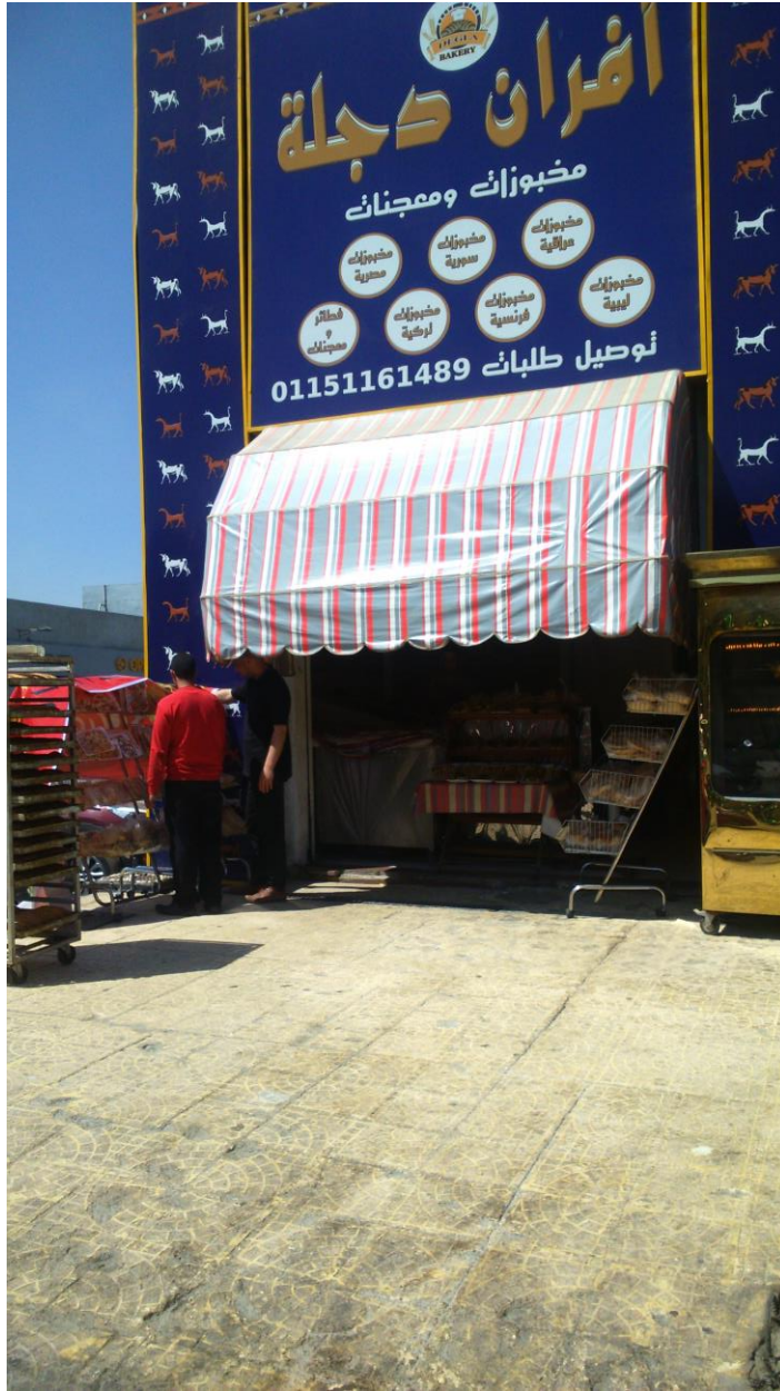
Fig (8): The Iraqi bakery: Degla Bakery ( Afran Degla ) in ElRehab market (السوق)