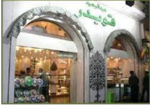
Fig(11): Syrian dessert shop (Quwaider) in Cairo