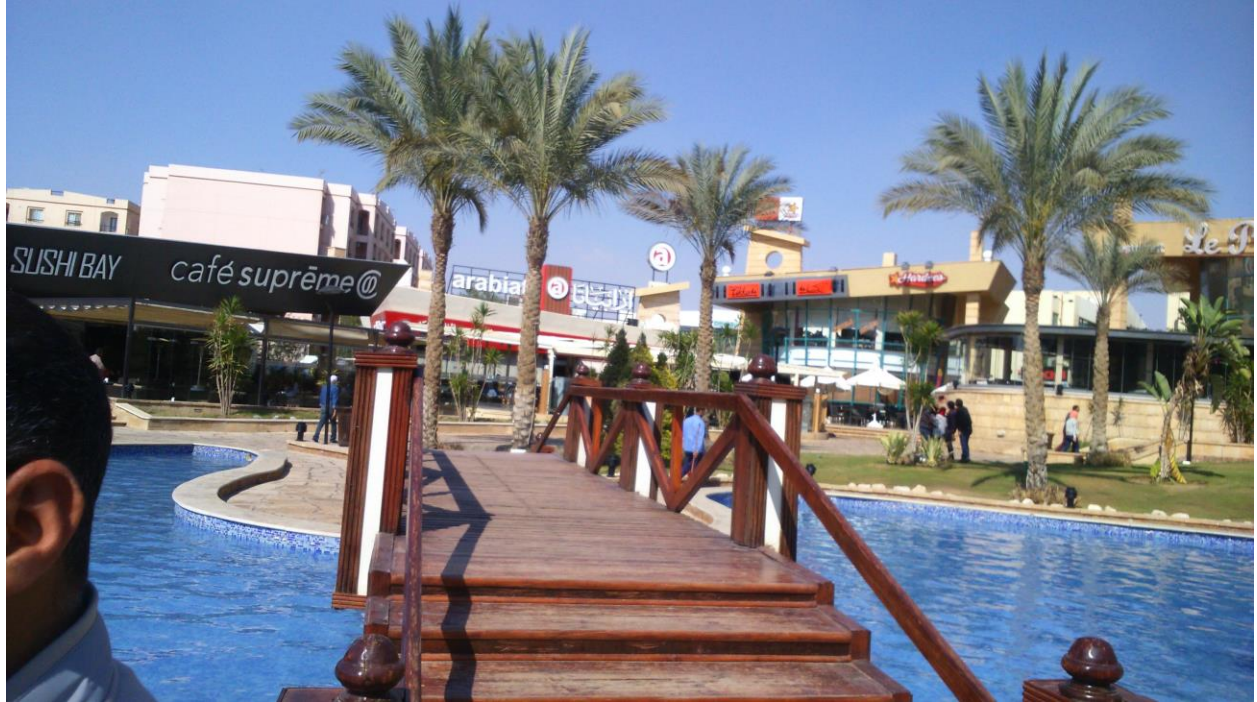
Fig (7): ElRehab food court. It includes local chains as “Café Supreme” and “Arabiata” along with international chains as” Hardees”.