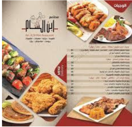
Fig(13) Ibn ElSham restaurant's menu.