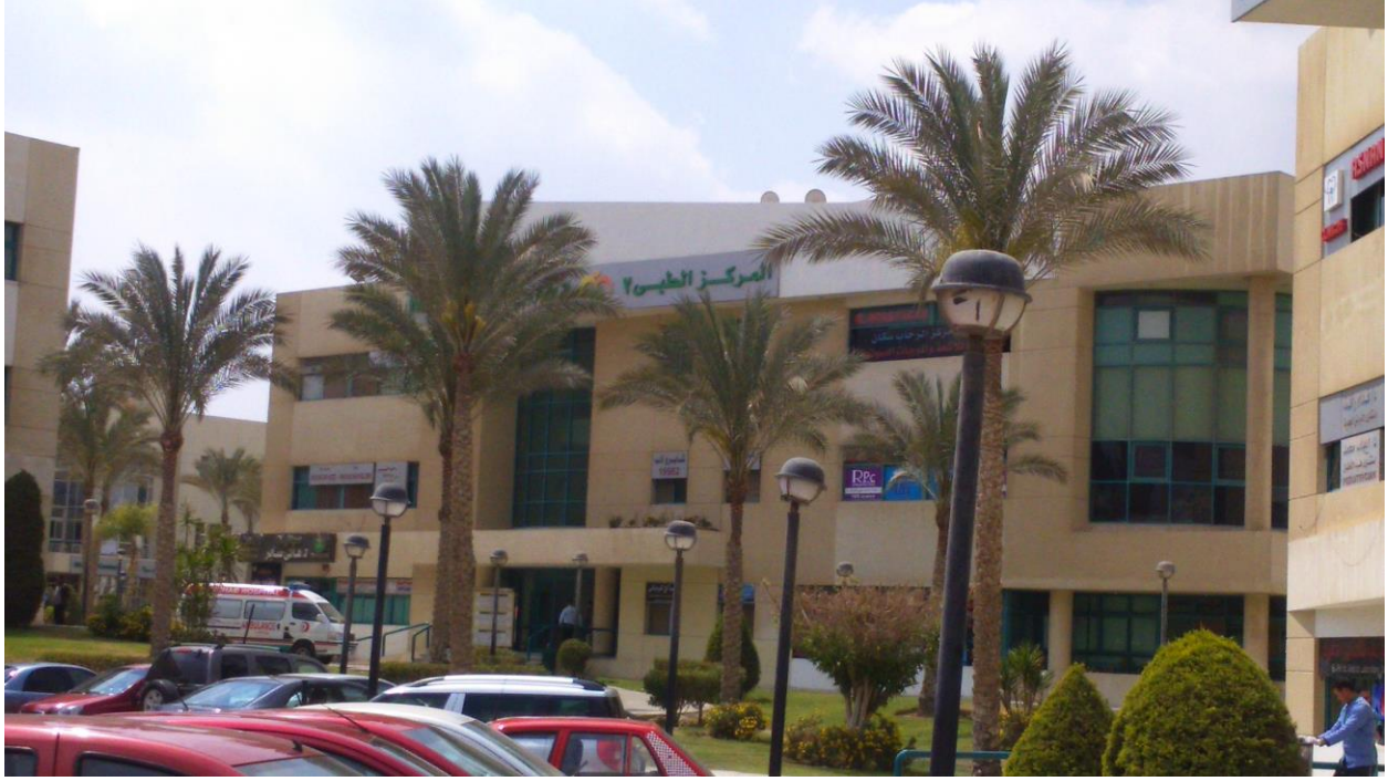
Fig (3) ElRehab Medical Center (2)