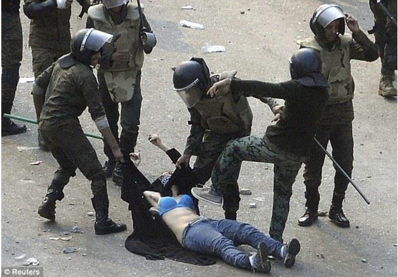
Fig(15): The Egyptian military police kicked a veiled women turning off her clothes.