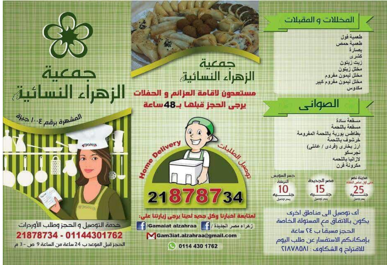
Fig(12): ElZahraa organization flyer