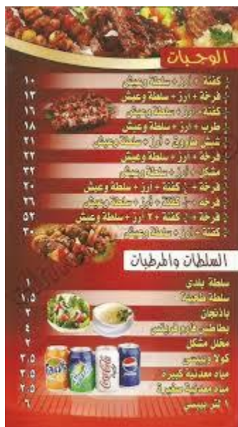
Fig (14) ELHaty restaurants' menu.