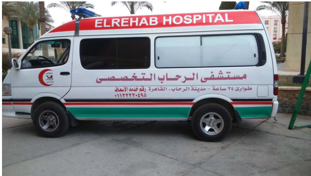
Fig (1): ElRehab ambulance service offered by ElRehab hospitals.