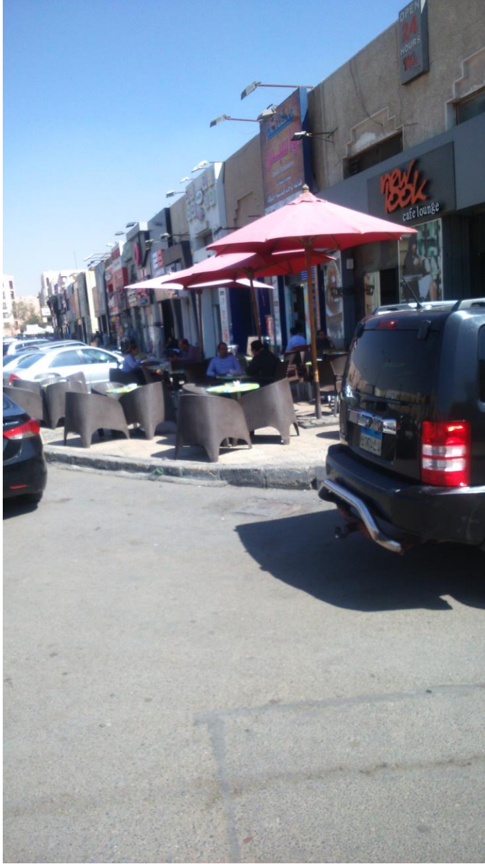
Fig (4): New Look café ( one of the oldest cafes in ElRehab market)