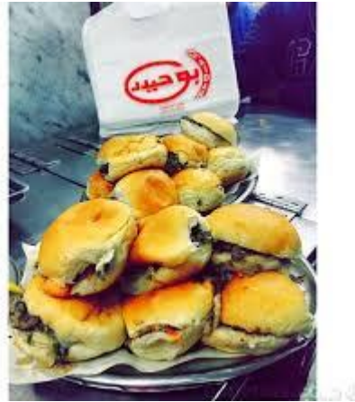
Fig(10): Syrian Restaurant(Abo Heider) in Heliopolis, Cairo