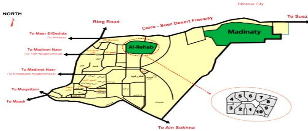
Fig(9): New Cairo Map. (July, 2017).