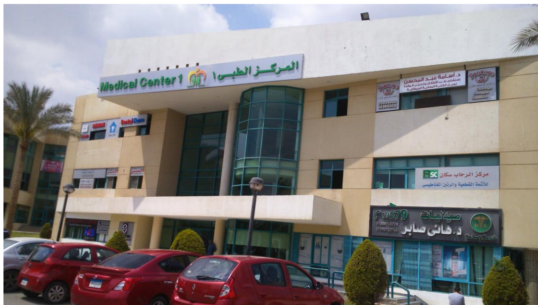
Fig (2): ElRehab Medical center 1